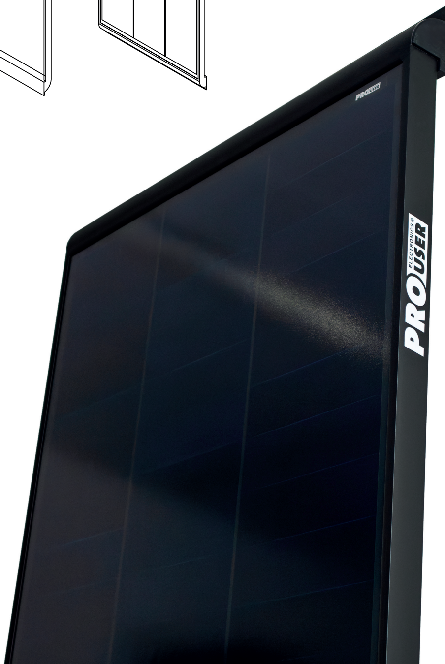
Solar Panel 120W Slimline SPS120